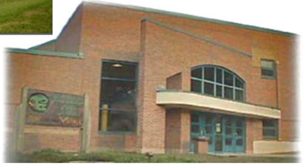
Blanchardville Building Middle/High School grades 6-12