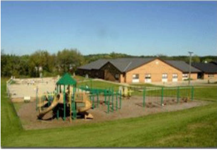
Hollandale Building Elementary grades 4K-5